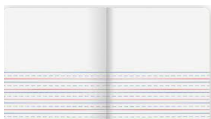
Example of primary composition notebook